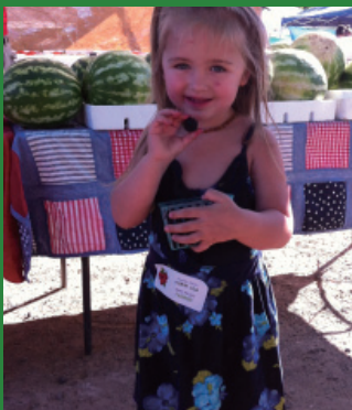
FARM Club member with blackberries