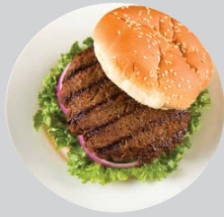
Hamburger with lettuce and onion 575 mg sodium